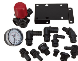
Control Unit / Bypass Valve